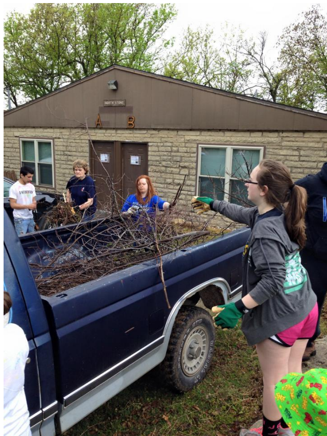
Youth and youth leaders are cleaning up brush at Camp Horizon in April, 2015.

The gloves and tools that we gathered in June were delivered last week. They are appreciated and will be put to good use.